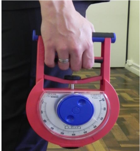
Figure 1: Illustration of the handgrip test

Volunteers were informed that they should wait for the evaluator's command to start performing each maximum gripping movement. They performed three repetitions of maximum strength contractions using the right hand and another three using the left hand. For the statistical evaluation, the average of the three measurements of each hand, before and after the intervention, were considered.