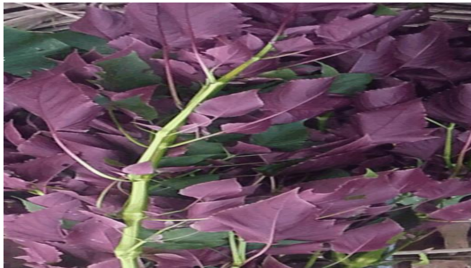
Figure 1: Photograph of Eremomastax speciosa (Hochst.) Cufod

The leaves of E. speciosa (Hochst.) Cufod were harvested from uncultivated farmlands in June 2015 from Ikot-Ekwere Itam in Itu, Akwa-Ibom State Nigeria and identified by Mr. Okon Etefia. A voucher sample label MOUAU/VPP/2015/15 was deposited in the departmental herbarium for reference purposes.