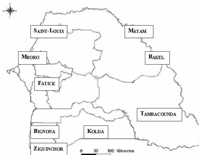
Figure 1: The primary zone for the collection of traditional leafy vegetables of Senegal