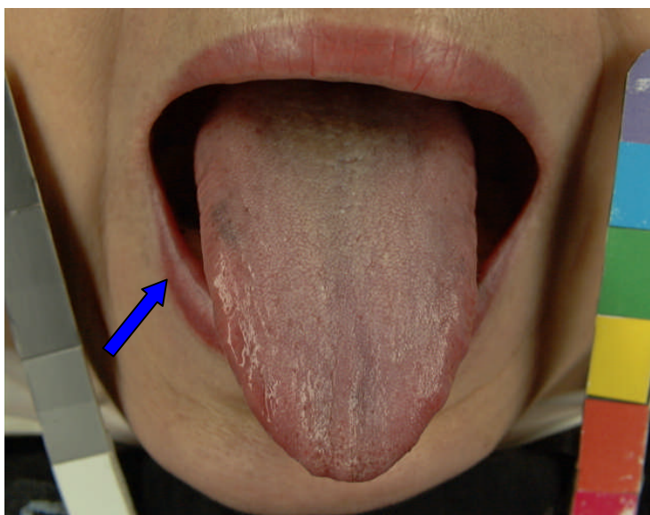
Figure 3: Stasis macule of tongue. The arrow points to a stasis macule of the tongue. In traditional Chinese medicine, this corresponds to the blood stasis pattern (BSP).