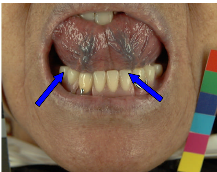
Figure 4: Sublingual blood stasis pattern. The arrows point to the sublingual vessel engorgement.