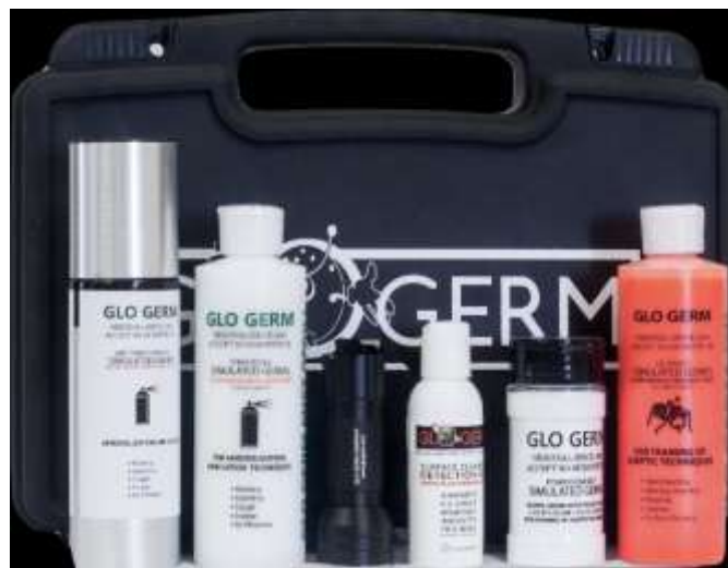
Figure 1: The Glo Germ Products full Kit.

A comprehensive visual study was conducted to evaluate the effectiveness of various surface cleaning techniques with cleaning tools in preventing the spread of germs using Glo Germ Kit (Figure 1). This last is a commercial product, containing a fluorescent dye activated by ultraviolet light. Two distinct types of surfaces, refined and coarse were employed. Also, both water and commercial detergent, as well as a smooth and rough cleaning cloth were applied to visualize and measure the efficacy of our cleaning habits. Furthermore, an illustrative study was undertaken during a COVID-19 awareness presentation, involving a random selection of students who were provided with Glo Germ cream and powder before the conference. Glo Germ was applied on their hands to follow its spread to surrounding objects, also the powder form of the product was scattered on one surface to observe the contamination of other areas. We also tried to reproduce an infected person's sneeze pattern, to observe the aerosol dispersal, and to demonstrate the importance of wearing a face mask with the mist formula of our product.